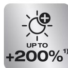
Up to 200% more brightness 1)

Quick and uncomplicated modification and installation