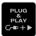
- Plug & Play

Fully dynamic LED mirror indicator with high-performance LEDs