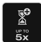
Up to 5 times longer lifetime3)

See and be seen with OSRAM. Cool white color temperature similar to daylight. For more safety on the road, especially when driving at night