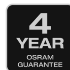
4 year OSRAM guarantee

Vibration resistant, environmentally friendly, and cost-efficient