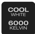
6000K & Cool White

The NIGHT BREAKER LED family - OSRAM's first street-legal1) LED retrofit lamps.